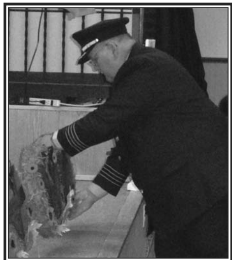
Fire Dept Chief