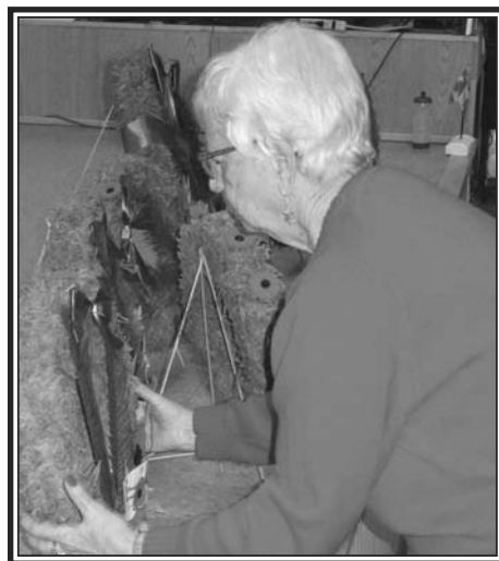
Placing a wreath