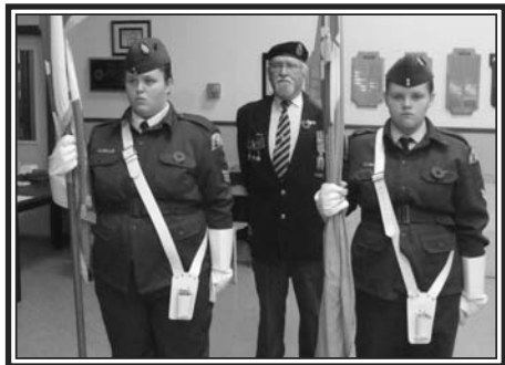
Colour Party