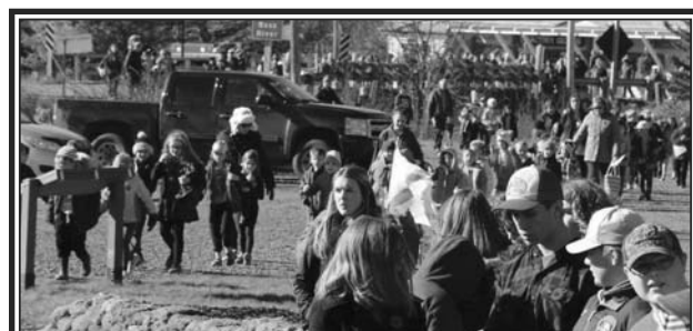
Hundreds of students from three school gathered at Veterans Memorial Park for the Service of Remembrance.