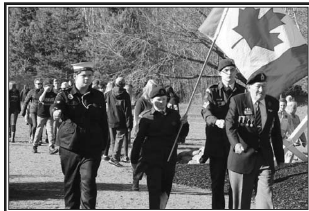
Colour Party enters the Veterans Memorial Park.