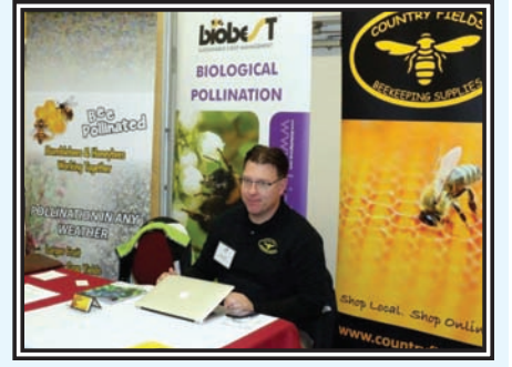
Country Fields Bee Keeping Supplies, Waverley, NS.