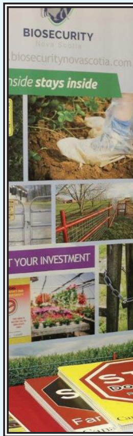
Bio-Security Nova Scotia, Bible Hill, NS.