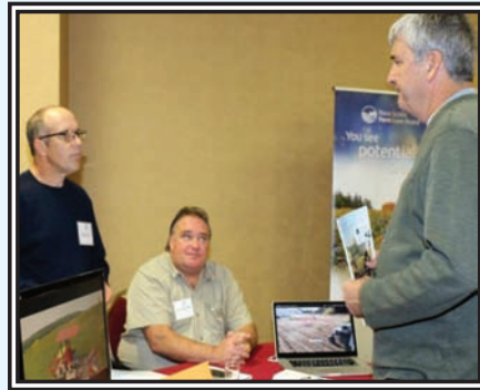
Pictou County Berry Ltd., Trenton, NS.