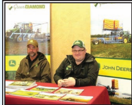
Green Diamond Equipment, Lower Onslow, NS.