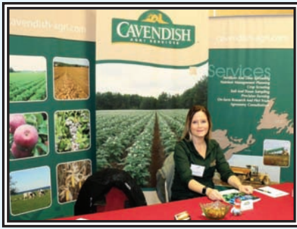
Cavendish Agri-Services, Truro, NS.