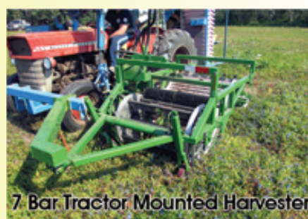
7 Bar Tractor Mounted Harvester

Easily operated by 1-3 people. Aluminum construction. 1/2 hp 110 volt variable speed with 2 speed trash blower.