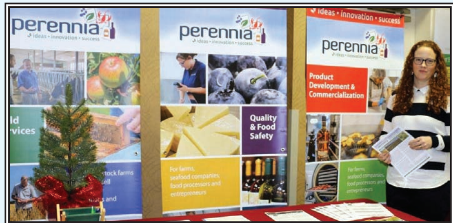
Perennia, Bible Hill, NS.