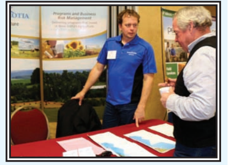
NS Crop & Livestock Insurance Commission, Truro, NS.