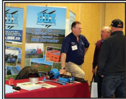
Doug Bragg Enterprises, Collingwood, NS.