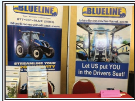
Blueline New Holland Equipment, Lower Truro, NS.