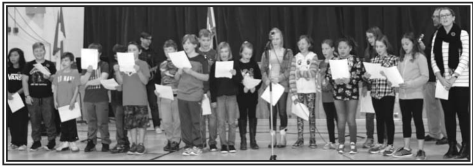
Grade 6 students at West Colchester Consolidated School sang "Where Have all the Flowers Gone?" during the Service of Remembrance.

The combined Great Village Elementary School and West Colchester Consolidated School Service of Remembrance was moved inside from Veterans Memorial Park because of inclement weather on Nov. 10th.