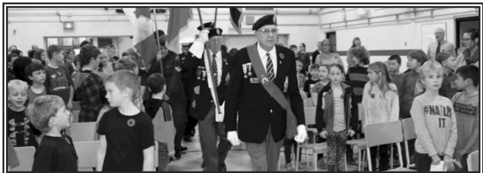
The Colour Party marches into the combined West Colchester Consolidated School Service of Remembrance.