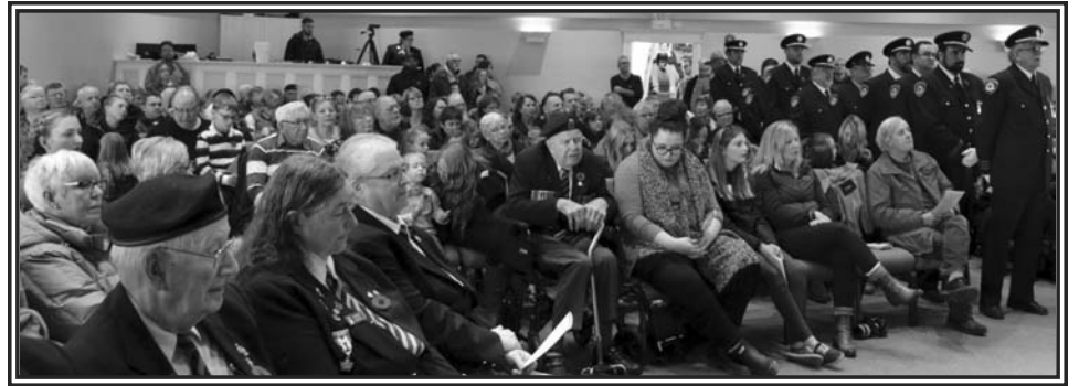
The 2017 Remembrance Service in Great Village was moved inside Faith Baptist Church due to the extreme cold. Over 350 people attended this year's service!