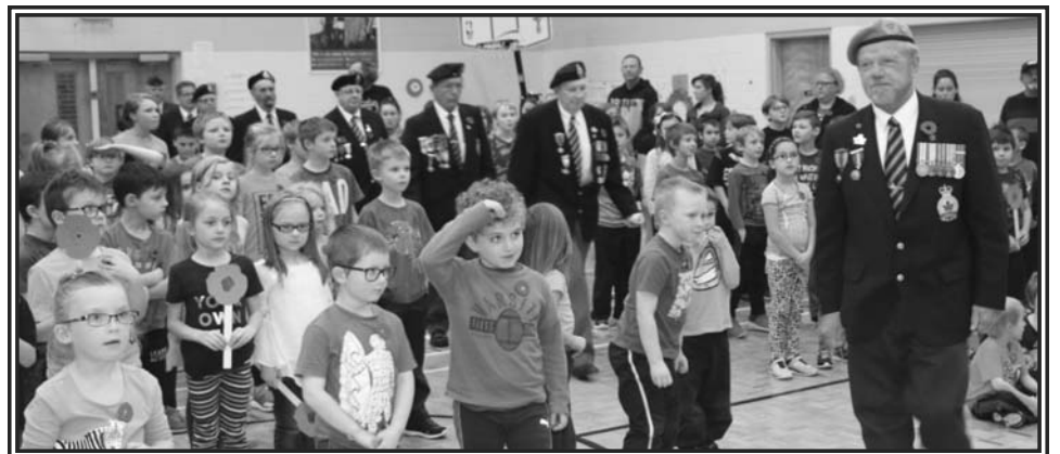
Members of the Debert Legion march in to the Service of Remembrance at Debert Elementary.