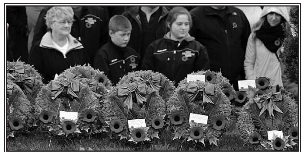
Forty-three individual wreaths were laid at the Cenotaph in Great Village.