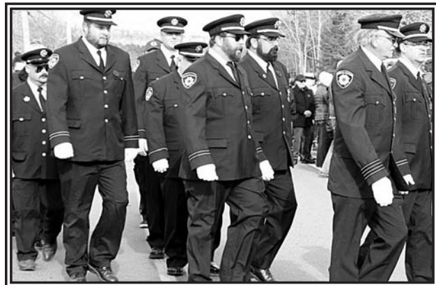
Great Village & District Fire Fighters on parade.