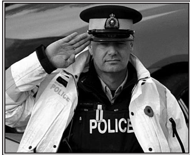
A member of the Bible Hill Detachment of the RCMP, on traffic control duty, pauses and salutes during the playing of Reveille.