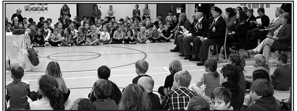
Chiganois Elementary School held their Remembrance Day Service on Nov. 10th with an assembly in the gymnasium.