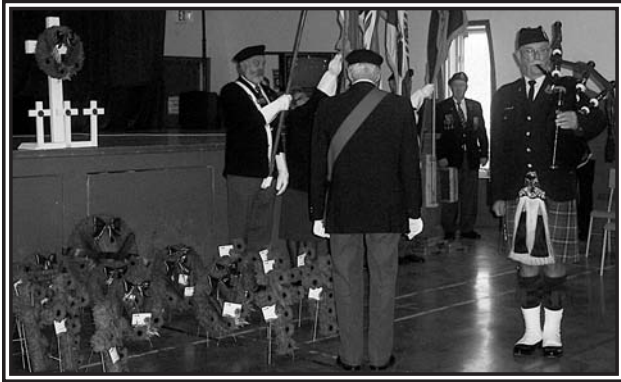
Members of the Royal Canadian Legion Branch #72