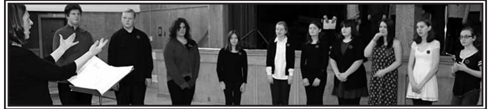
The newly formed Central Colchester Junior High Choir performed during the Service.