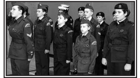
Royal Canadian Air Cadets 77th Arrowhead and 88th Sea Cadets took part in the CCJHS Service of Remembrance.