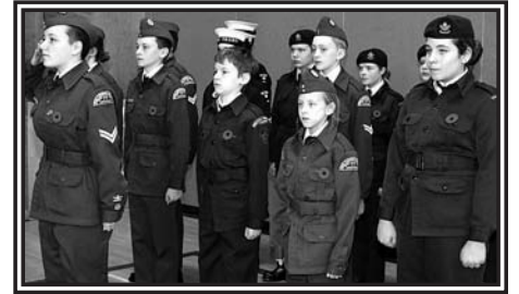
Royal Canadian Air Cadets 77th Arrowhead and 88th Sea Cadets took part in the CCJHS Service of Remembrance.