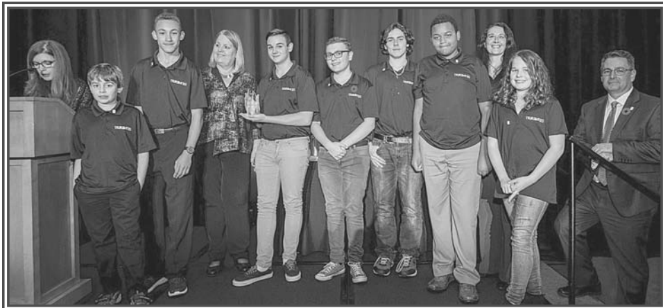
It's a big step forward for a group of 10-14 year olds from Colchester, who are now known as TRUROBOTICS to be on stage in front of hundreds of people to accept the Innovator of the Year award at the DivertNS sponsored 18th Annual Mobius Environmental Awards. They are now in the process of obtaining a Canadian and USA patent on their environmentally disposal plastic bag.

over twenty-eight thousand worldwide. They're in the process of patenting their idea in the US and Canada, and they're working with local experts at Perennia Park Innovation Centre in Bible Hill to continue to refine their idea, and prepare the product for market.