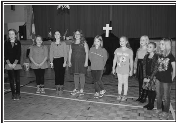
Debert Elementary's Remembrance Day Service featured delightful singing by this enthusiastic group of students.