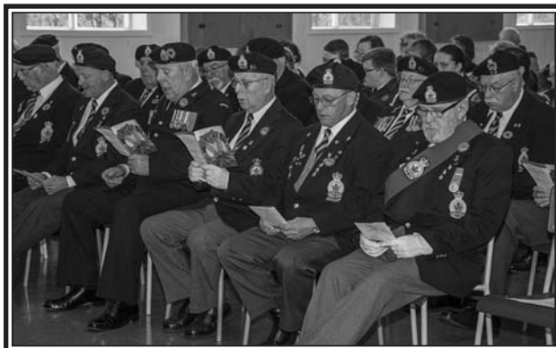
Veterans at the ceremonies at Parrsboro Legion.