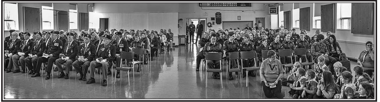
Ceremonies in the Legion hall prior to marching to the cenotaph.