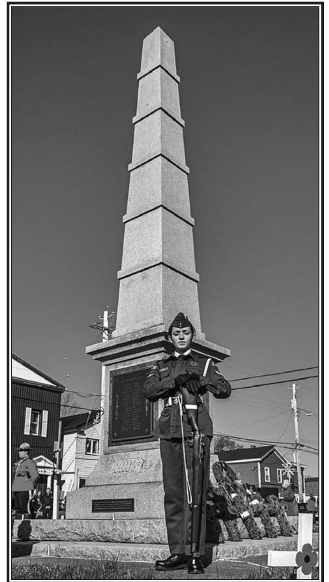
Standing tall at the Parrsboro Cenotaph awaiting laying of the wreaths.

2014 Remembrance day was well attended in Parrsboro, as in previous years. The morning starts with ceremonies at the Legion, followed by the parade to the cenotaph. This year our veterans were brought to focus with the Quebec and Ottawa tragedies. In any year there is a good turnout of citizens, but this year the turnout was even larger to honour those who served and continue to serve.