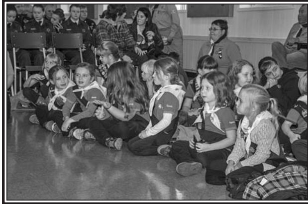
Ages 5-6 Parrsboro area Sparks attended the service.