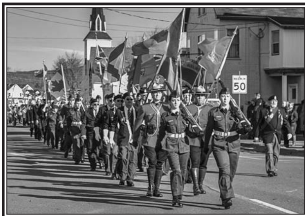
It was warm and sunny as spectators filled the sidewalks to watch Parrsboro's Remembrance Day Parade.

2014 Remembrance day was well attended in Parrsboro, as in previous years. The morning starts with ceremonies at the Legion, followed by the parade to the cenotaph. This year our veterans were brought to focus with the Quebec and Ottawa tragedies. In any year there is a good turnout of citizens, but this year the turnout was even larger to honour those who served and continue to serve.