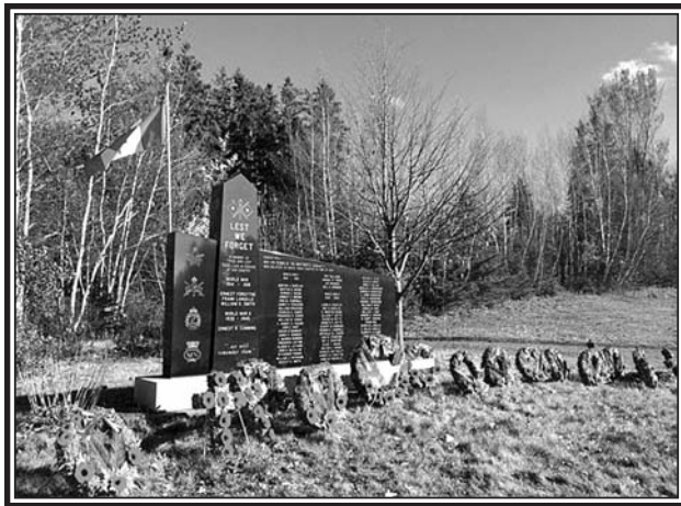
It was a fine day and many wreaths were laid while a large crowd gathered at the Cenotaph in Wentworth.