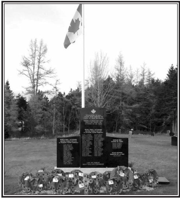
The Diligent River War Memorial was unveiled on November 4th, 2012 following fund raising efforts by a local community. Shown above is the wreaths laid at a Remembrance Day Service held on November 9, 2014.