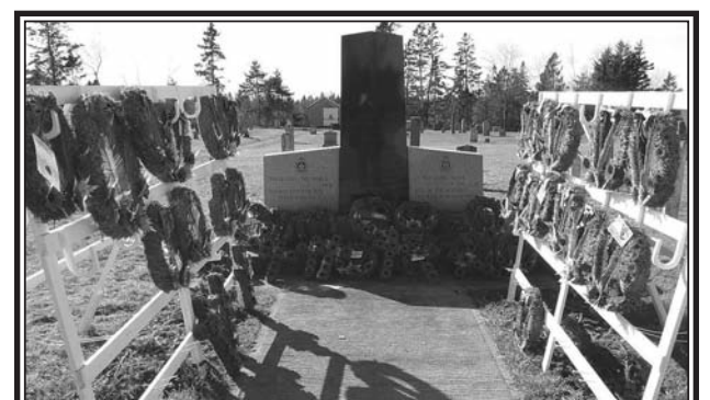
During recent years, so many wreaths have been laid during Debert's service, Legion members have constructed two special racks to handle an additional 50 wreaths.