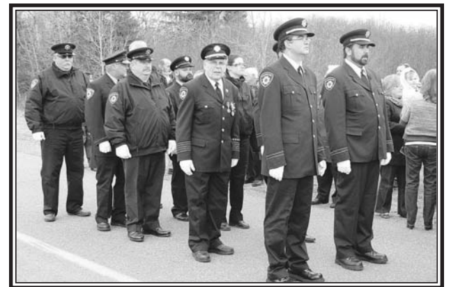
Great Village Fire Brigade was well represented on parade.