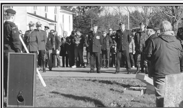
RCMP, officers in uniform and Debert Fire Brigade members always play a prominent role in Debert's services on November 11th.