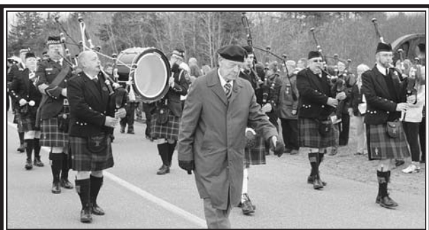
Marching to the cenotaph for the Londonderry Remembrance Day Service.