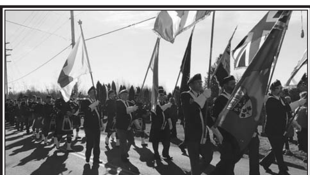
Debert's Remembrance Day service always includes a large parade.