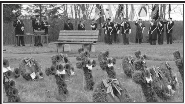
A combined Legion Color Party is the backdrop for wreaths and crosses adorned with poppies.