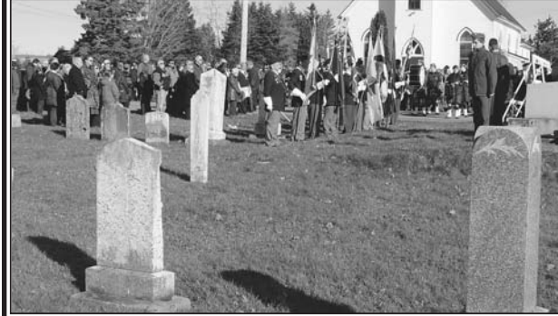
Under sunny skies a large crowd watched as wreaths were laid during Debert's Remembrance Day service.