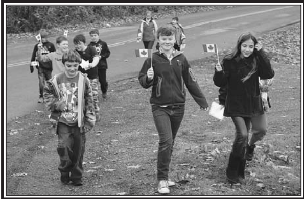
Students walked down the hill from WCCS to Veterans Memorial Park with their Canadian flags fluttering in the wind.