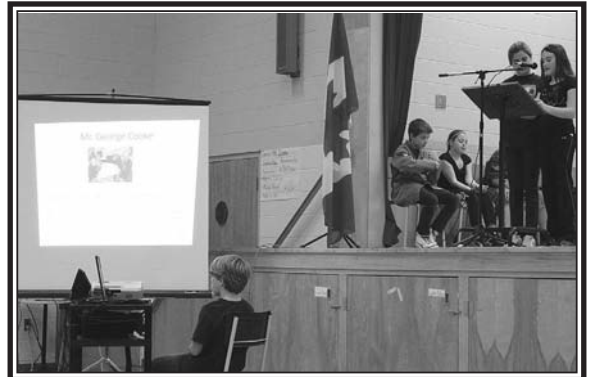
Grade 6 students at Debert Elementary interviewed several Veterans in the area, took their photo and prepared a slide show with information about their years in the military. The presentation was shared at a Remembrance Day Assembly.