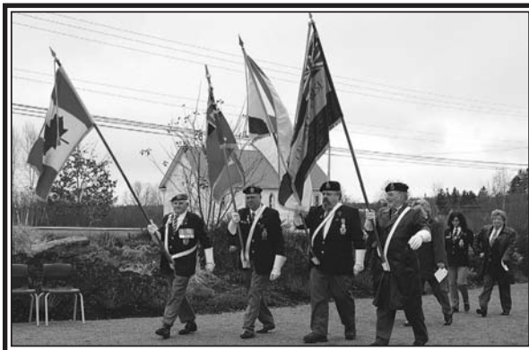
Legion Color Party marches into Veterans Memorial Park for the WCCS and BRES Remembrance Day Service on Nov. 9th.