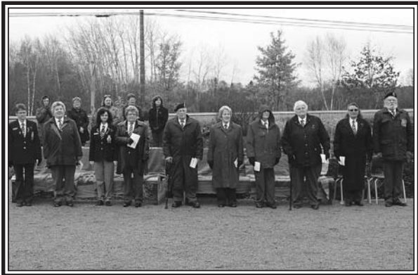
Legion members and parents gathered at Veterans Memorial Park on Nov. 9th for the school service.