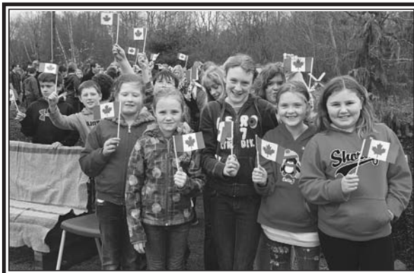
WCCS students were proud to wave Canada's flag, as they gathered to remember our War Veterans.