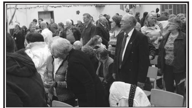
Every November 11th the Five Islands fire hall is filled to capacity with a large crowd to observe Remembrance Day services.