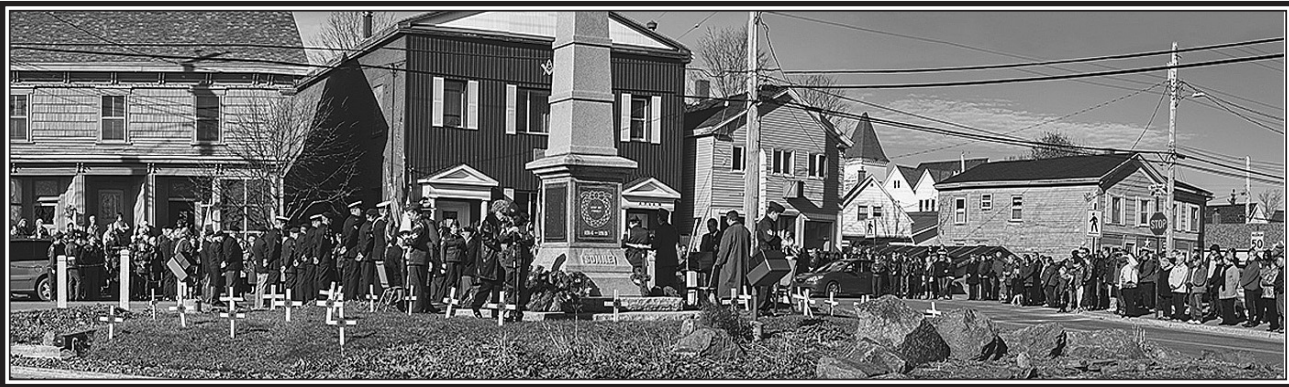
This wide angle photo illustrates the large crowd who turned out for Parrsboro's Remembrance Day service.