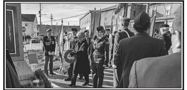
Parrsboro's Mayor Lois Smith lays a wreath during the service.