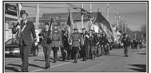
The weather provided a wonderful background to the Nov. 11 Remembrance Day Services in Parrsboro. A large parade made its way down Main Street to the monument.