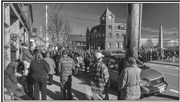
The sidewalks and Main Street were lined with several hundred residents who attended Remembrance Day services in Parrsboro.