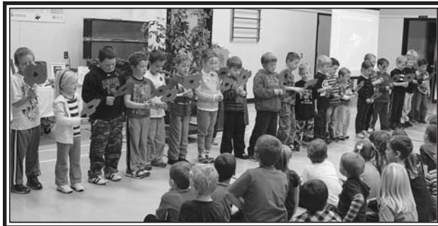
Grade one students recite a poem about the red poppy, during the Chiganois Elementary Remembrance Day Service.