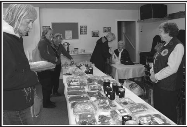
The Debert Garden Club hosted a "Tastes of Home" Bake Sale on Nov. 10th at the King George Lodge, Debert. From fudge to apple pie, it all looked delicious.