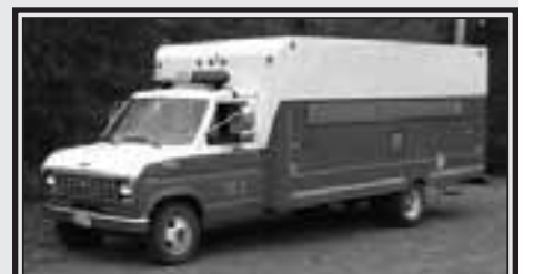
1986 Ford Econoline 350 Walk Thru Rescue Van, equipped with a diesel engine and automatic transmission. (submitted)