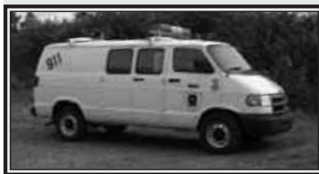
A 1998 Dodge van, used as the Marine Rescue Van. This unit is used to tow the Zodiac unit to the launch point from which any operation would begin. (submitted)