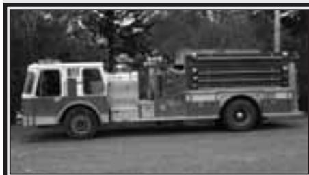
1986 Federal Pumper/Tanker with 2000 gallon aluminum tank. (submitted)