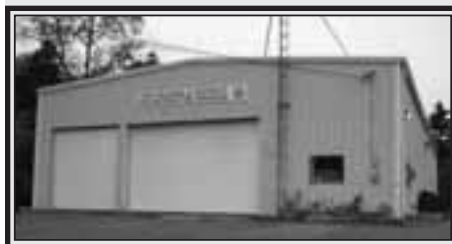
The Five Islands & District Fire Hall. (submitted)