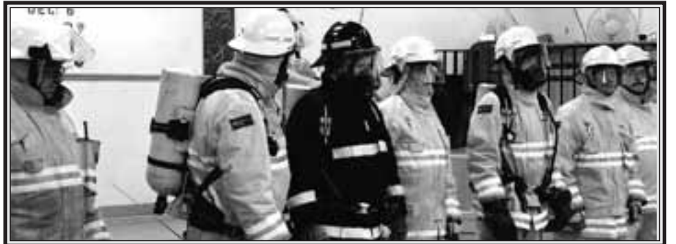
Fire Islands firefighters wearing their turnout gear at last year's fashion show. (submitted)