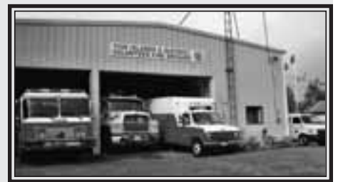
The Five Islands & District Fire Hall with fleet of vehicles all lined up. (submitted)