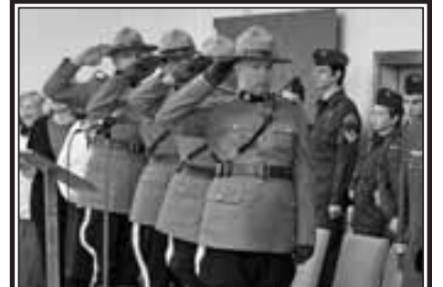
RCMP saluting during "God Save the Queen"