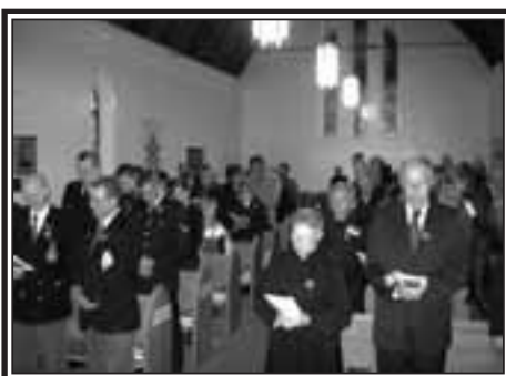
In spite of the bad weather a large crowd attended Remembrance Day services in the church.