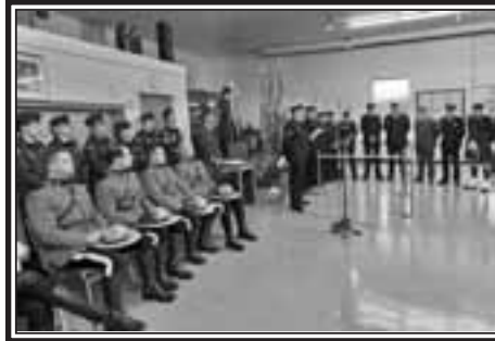
Reading the names of those who died in WWI and WWII.