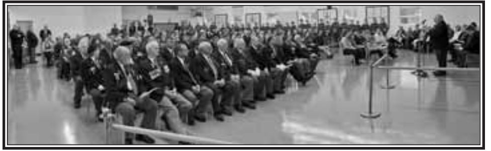
A large crowd turned out to remember our veterans.