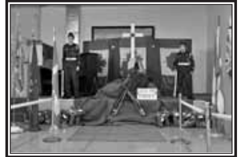
Parrsboro Legion created a 'Cenotaph' for the ceremony