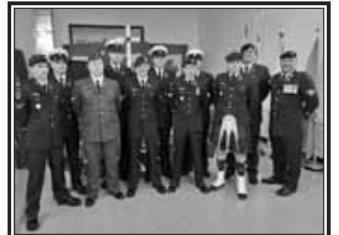
Our future veterans