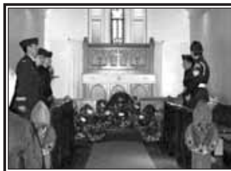
Due to inclement weather, Remembrance Day services were held in the church.