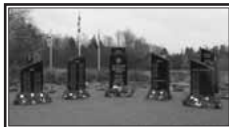
After the Remembrance Day ceremonies held at West Colchester Consolidated School wreaths were later transferred to Veteran's Memorial Park.