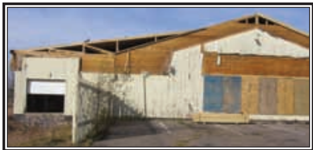
It will be a winter's project for C.E. Harrison's renovating and setting up a new store in the former Fundy Shore Market building. Construction workers were busy installing a new room and other exterior repairs before the onset of winter. A store is expected to open in the the spring.