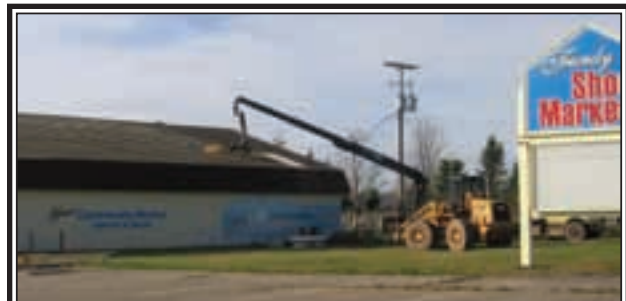
C.E. Harrison's have purchased the former Fundy Shore Market property and over the winter will be carrying your major renovations. Excavation work has already been done to create a new lumber yard at the site.