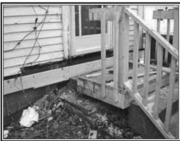
Rotting sills required extensive work to the Parrsboro Band Hall. Now that repairs are being completed, more community usage of the hall is anticipated.