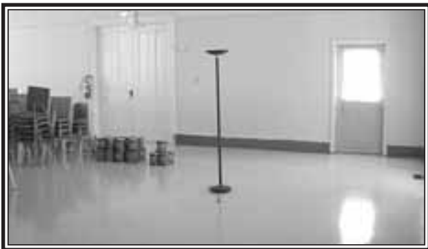
Not only has the interior of the Band Hall been updated with a fresh coat of paint, also look at the gleaming floors.