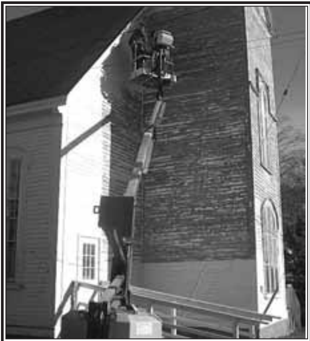
Early November brought a new coat of paint to the Parrsboro Band Hall. Repairs have been ongoing, but only now are they becoming visible.