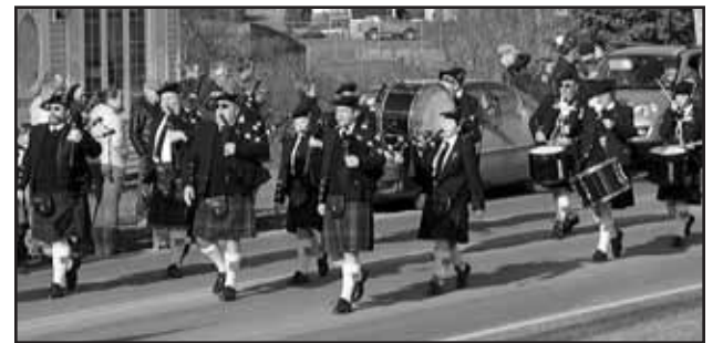
Old Scotia Pipes and Drums accompanied the Remembrance Day Parade in Great Village.