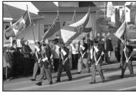
Royal Canadian Legion Cobequid Branch #72 Color Party marches to the Great Village Cenotaph.