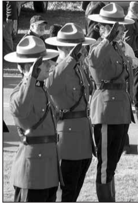
RCMP officers salute during playing of The Last Post at the Remembrance Day Service held at the Great Village Cenotaph.