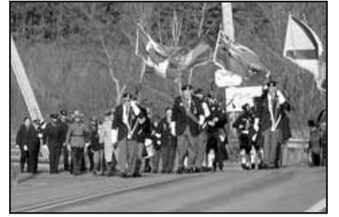
The Legion Colour Party leads the Remembrance Day Parade.