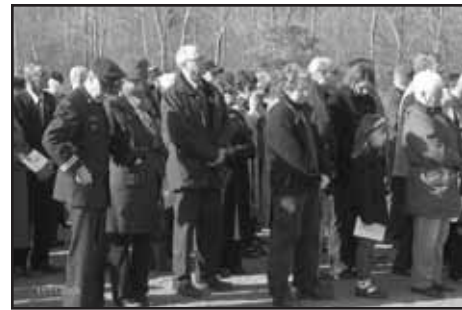
A large crowd assembled for the Remembrance Day Service.