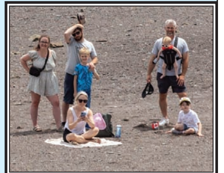
Folks on the Beach listening in.