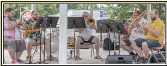
Bedford Brass Quintet