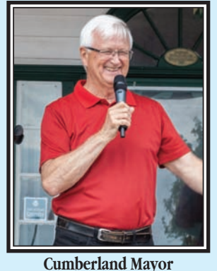
Cumberland Mayor Murray Scott