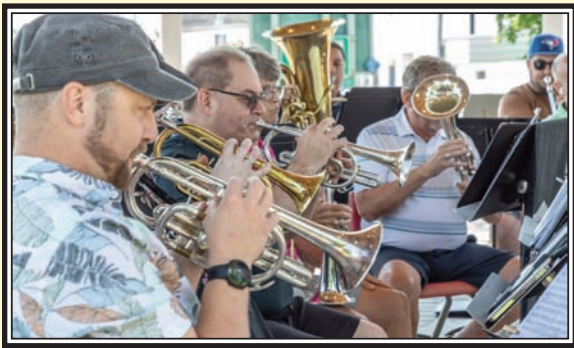
Great George St Brass Band