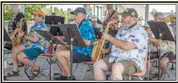
Elastic Big Band