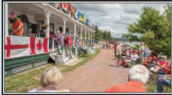
Ottawa House, crowd gathers.

A full afternoon and a beautiful day at the Ottawa House with songs by Bartlett's Privateers followed by the Parrsboro Citizens Choir. Even the folks on the beach stopped to listen in. Flag raising and O'Canada and messages from our various representatives. Lots of cake for free to get a taste of what was to follow, cake and other goodies by auction as fund raiser. Photos by Lawrence R. Nicoll.