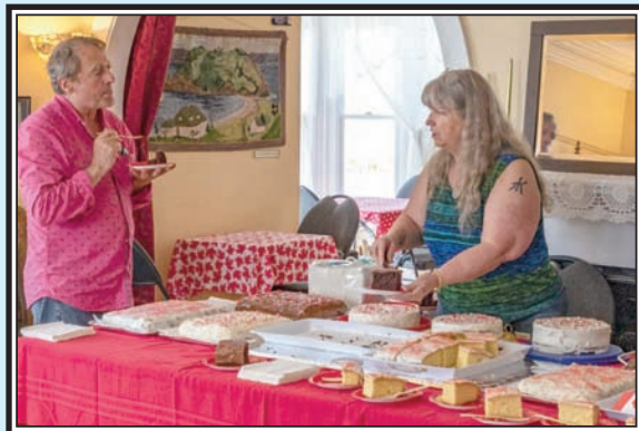
Ottawa House, special delicious food service.