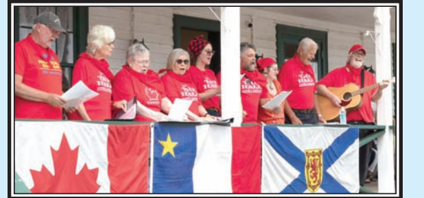
Bartlett's Privateers perform.