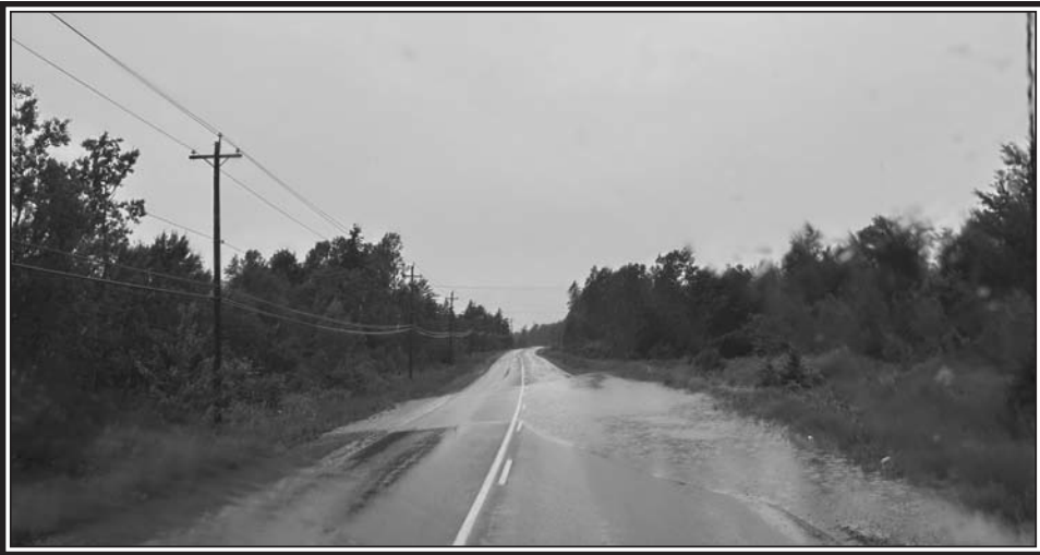
Plains Rd in Debert had some water over the road after the torrential rains on July 21.