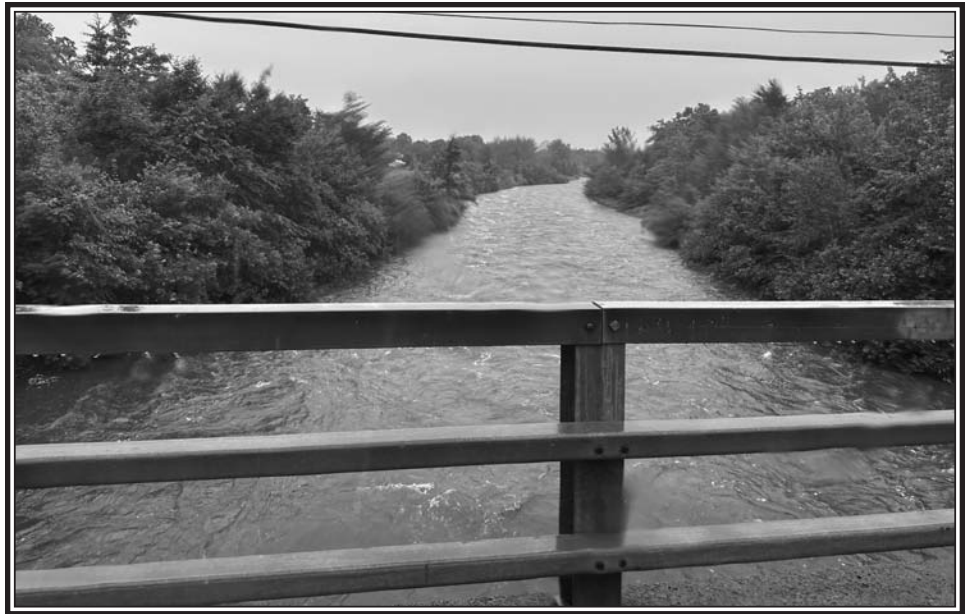
The Debert River was very high on the morning of July 22nd after close to 100mm of rain.