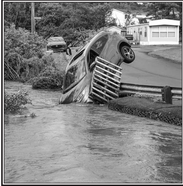
A car lodged on a guardrail and partially submerged in flood water along the Little Sackville River in Middle Sackville, on Saturday, July 22.