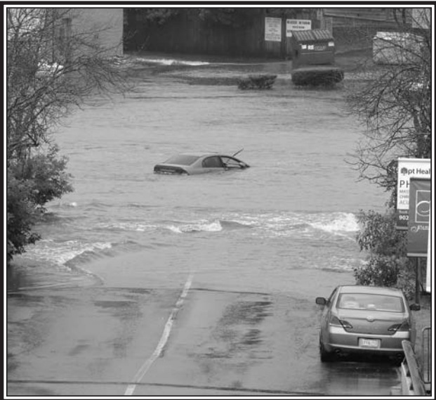
A car is nearly submerged at the entrance to Bedford Place Mall