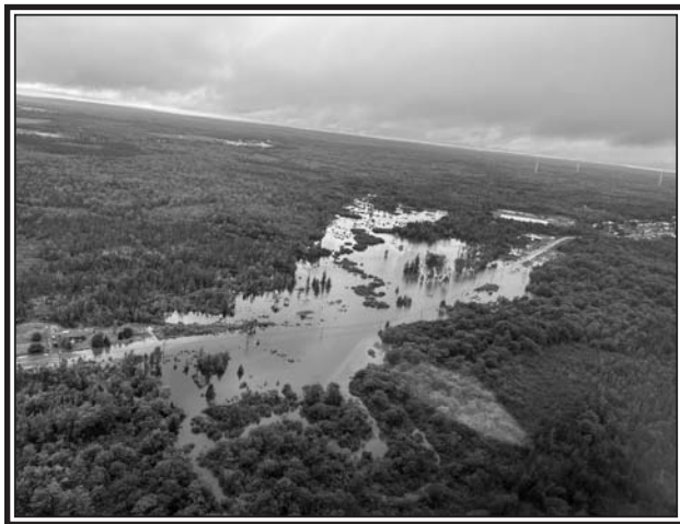
Water flooded over the road in Mill Village near the entrance to Sipekne'katik First Nation.