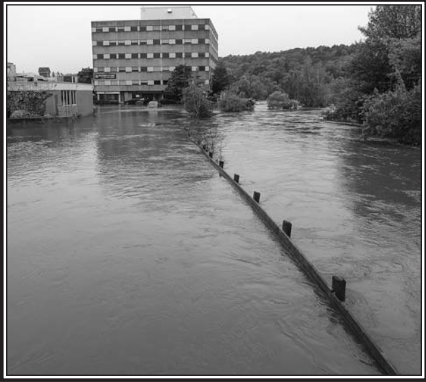
The Sackville River overflowed, submerging a parking lot in Bedford