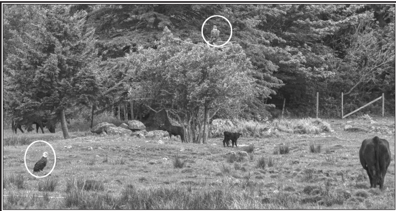
At the Hanna farm a young and adult eagle appeared to perhaps think they were cows. Two white circles mark location of the eagles in the tree and on the ground.