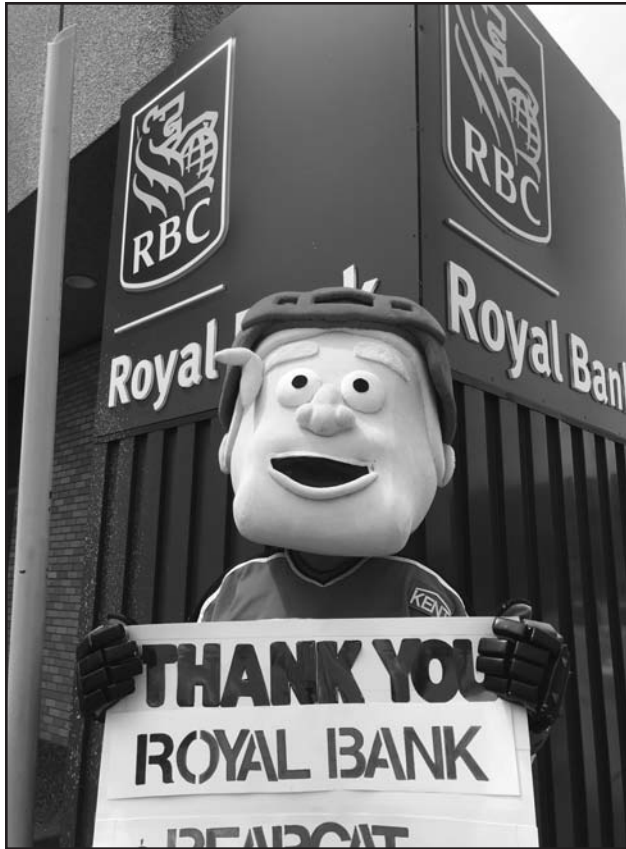
Jack the Hockey Player, one of the Truro Junior A Bearcat mascots pops in to the Royal Bank and extends a big thank you for their support during the past hockey season.