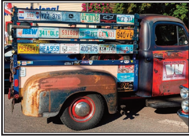
Adorned with a large selection of antique license plates this truck attracted a lot of attention at the annual Parrsboro Car Show. And, this green beauty is an example of hundreds of hours of exacting restoration. See story and more photos on page 3.