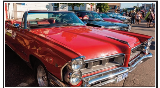
One can only think about how many parades this red convertible has participated in mostly to transport local beauty queen contestants and to show off the fine restoration workmanship.