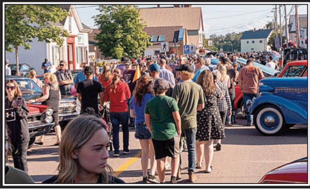
If you didn't recognize the buildings, the size of this crowd might cause you to think you were in New York's Times Square. Not only was it a good event for downtown Parrsboro, but the recent car show generated one of the largest crowds in many years. People are starting to get rid of the cabin fever created by CoVid-19.