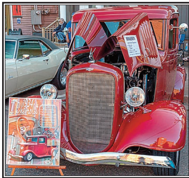
Not sure if the colour is "ruby red" but this fine example of hard work was an attraction at Parrsboro's Car Show which drew the largest crowd for many years.