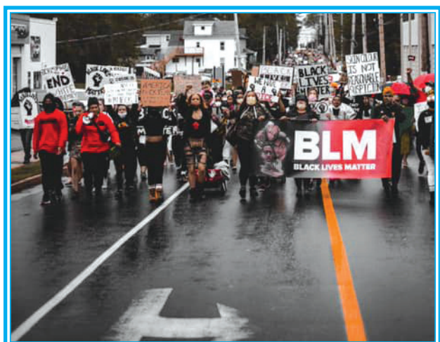
Truro's 'Black Lives Matter' parade makes its way down Prince Street in Truro on June 13. Organizers expected up to 300 participants but were delighted to have over 1000 in attendance. Story and more photos on page 11.