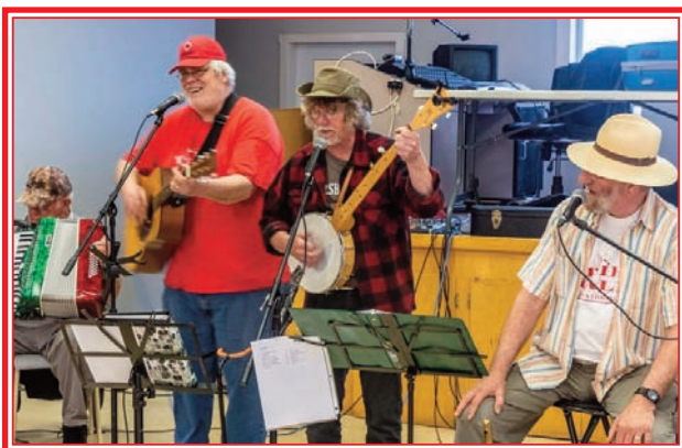
It might have been wet and overcast outside, but there was plenty of entertainment inside the Fire Hall during Parrsboro Fireman's Day festivities on July 1.