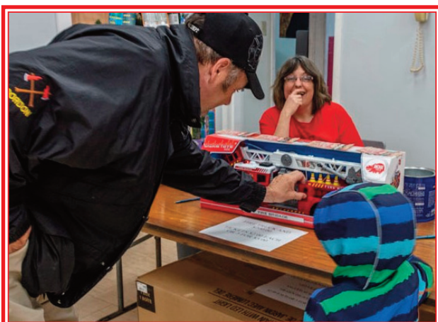
Hoping to win the model fire truck was all this young fellow could think about during Fireman's Day.