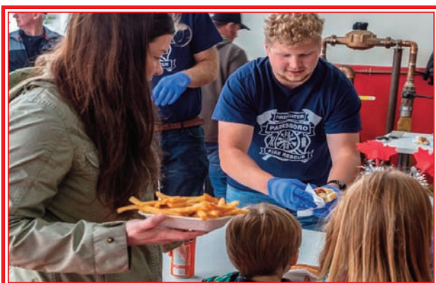
The Fire Department's food concession is always a popular spot when local residents show up to show appreciation to volunteer firefighters during Fireman's Day on July 1st following Parrsboro's Canada Day Parade.