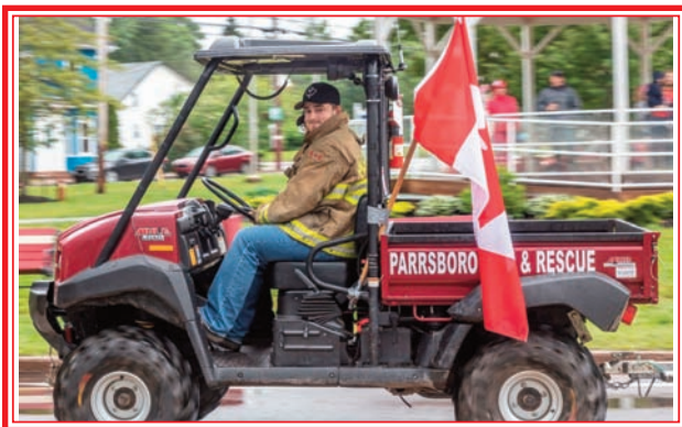
Parrsboro Search and Rescue are always there to help, but on July 1st they decided to enter Parrsboro's Canada Day Parade.