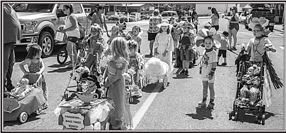
There were plenty of entries for the Old Home Week, Doll Carriage Parade.