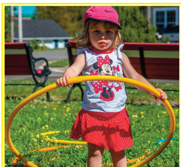
Mommy, "How do I do this, like sissy?".