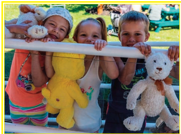
A teddy bear picnic requires meeting up with friends and each one has at least one teddy bear.

FPW Fire Brigade's will celebrate its 50 th Anniversary Fireman's Field Day, 11:00am - 4:00pm on August 4 th at 8484 Highway 209, Port Greville. Plenty of activities and sun for all ages including street parade, kids games, canteen, chicken dinners, silent auction, vendor tables and chicken bingo. Ship's Company Theatre was the only organization from Cumberland and Colchester to receive funding under the province's New Culture Innovation Fund. Thirty one projects were announced on July 4 th for 2017-18 under the $1.5 million Culture Innovation Fund. Ship's Company Theatre received $50,000 for its initiative Tour Chasing Champions in Nova Scotia, 50,000. The Culture Innovation Fund is made possible through Support4Culture, a designated lottery program from Nova Scotia Gaming that supports arts, culture, and heritage in communities across Nova Scotia. A full listing of projects receiving grants from the Culture Innovation Fund can be found at https://cch.novascotia.ca/culture-innovation-fund Oxford Frozen Foods is celebrating their 50th Anniversary at an event in Oxford on Saturday, July 28th. They are expecting approximately 2500 people to attend. The event is at the Exhibition grounds in Oxford from 10am - 5 pm on July 28. The 53 rd Annual Gem & Mineral Show will be held at the Lion's Arena, Parrsboro on August 17-19 th from 10 am to 5 pm daily.