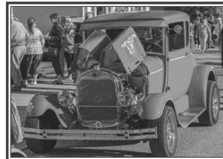
This bright red antique attracted many admirers.