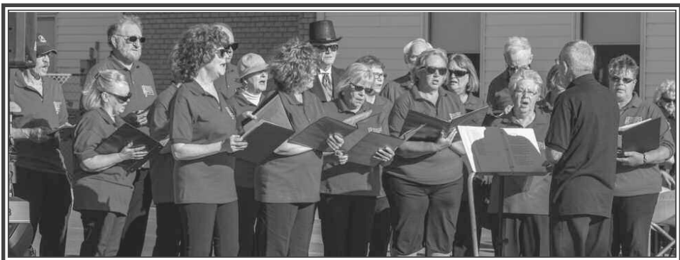
Parrsboro Citizens Choir provided great music during Old Fashioned Saturday night.