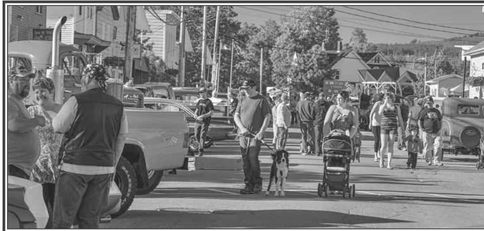
Main Street Parrsboro was filled with antique vehicles and pedestrians during Old Fashioned Saturday night. As usual there was a large crowd as the evening experienced good weather.