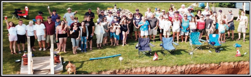
Approximately 60 old and new family/friends came together July 1st at "Smith day on the bay" reunion in Bass River. On a beautiful sunny day, old memories were shared and new ones were made. The night ended with a bonfire and fireworks show over the bay. The above photo was taken with a drone.