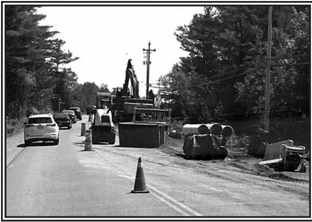
It's been stop and go traffic on Plains Road, Debert as new water mains are installed in preparation for the construction of a new water tower.