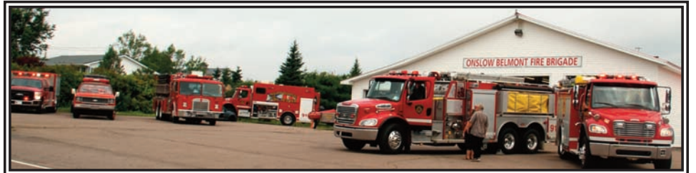
Onslow Belmont fleet of trucks and rescue units all lines up for the Open House on July 23rd.

Onslow Belmont Fire Brigade held an Open House and membership recruitment on July 23rd at the fire hall in Lower Onslow