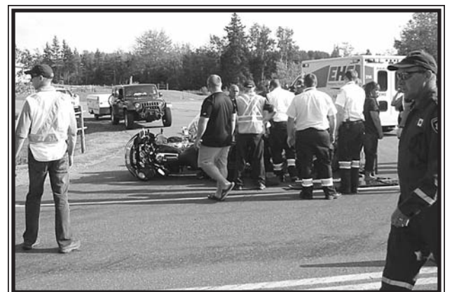
It didn't take long for Onslow-Belmont Fire Brigade First Responders to arrive at the scene of an accident involving two motorcycles at the rear entrance to Masstown Market at supper-time on Wednesday, July 23 rd. Shortly thereafter two ambulances and RCMP arrived. Paramedics and OBBF first responders attend to the injured cyclist.