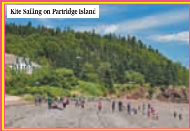
Kite Sailing on Partridge Island

Parrsboro's annual Old Home Week parade went off with some of the best continuous good weather in memory. No event had to be changed, and the children had a wonderful time either watching or participating.