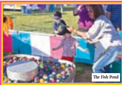
The Fish Pond

For the first time in memory during Parrsboro's Old Home Week the rides were never interrupted by rain, nor was the grounds muddy from night-time showers. The fine weather resulted in larger crowds enjoying OHW, which is sponsored by Parrsboro Lions & Leos. A great time was had by all ages.