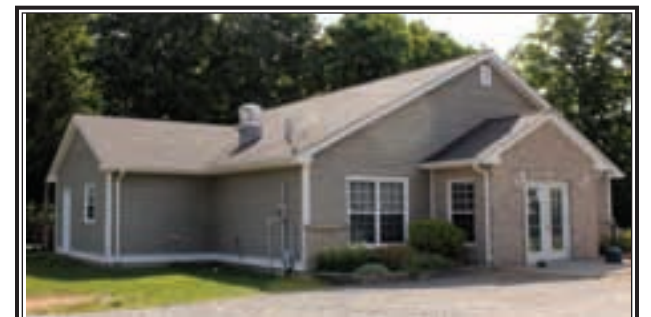
The Debert Golf Club's 10th Anniversary is a happy time for golfers, staff and ownership group. The clubhouse was built in 2002 in anticipation of the opening in June of 2003.