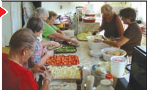
It takes many hands to put on community suppers. This kitchen crew were very busy getting ready for the Upper Londonderry Pastoral Charge Strawberry Supper on July 3rd.