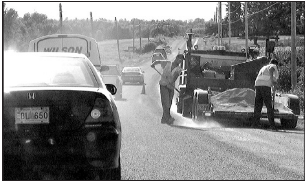
Long waits of single lane traffic and flying stones were annoying for motorists as worker endured hot dusty days resurfacing the road along Highway#2 in Portapique.