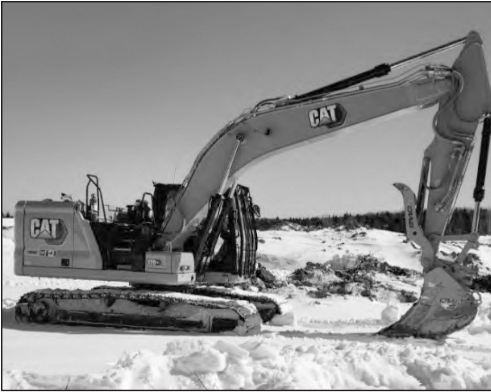
The Toromont Cat procurement process was completed at a price of $314,612. Their bid came with the extra set of hydraulic lines needed to install the grapple attachment at no additional cost. It was delivered in January and is the same Cat 320GC model that was purchased last August to replace the excavator that caught fire in May.