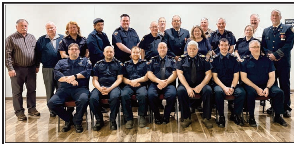
Group photo of present members, former Chiefs and Life Members of the Debert Fire Brigade present at the Banquet on March 10th.