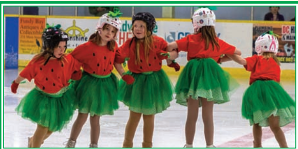
Walking on Sunshine