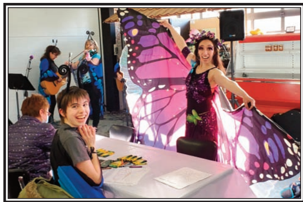
More than 200 people attended a Welcome to Spring - Butterfly and Blossom Celebration at the Truro Farmers' Market on March 21, hosted by the Truro & Colchester Chamber of Commerce and the Downtown Truro Partnership.