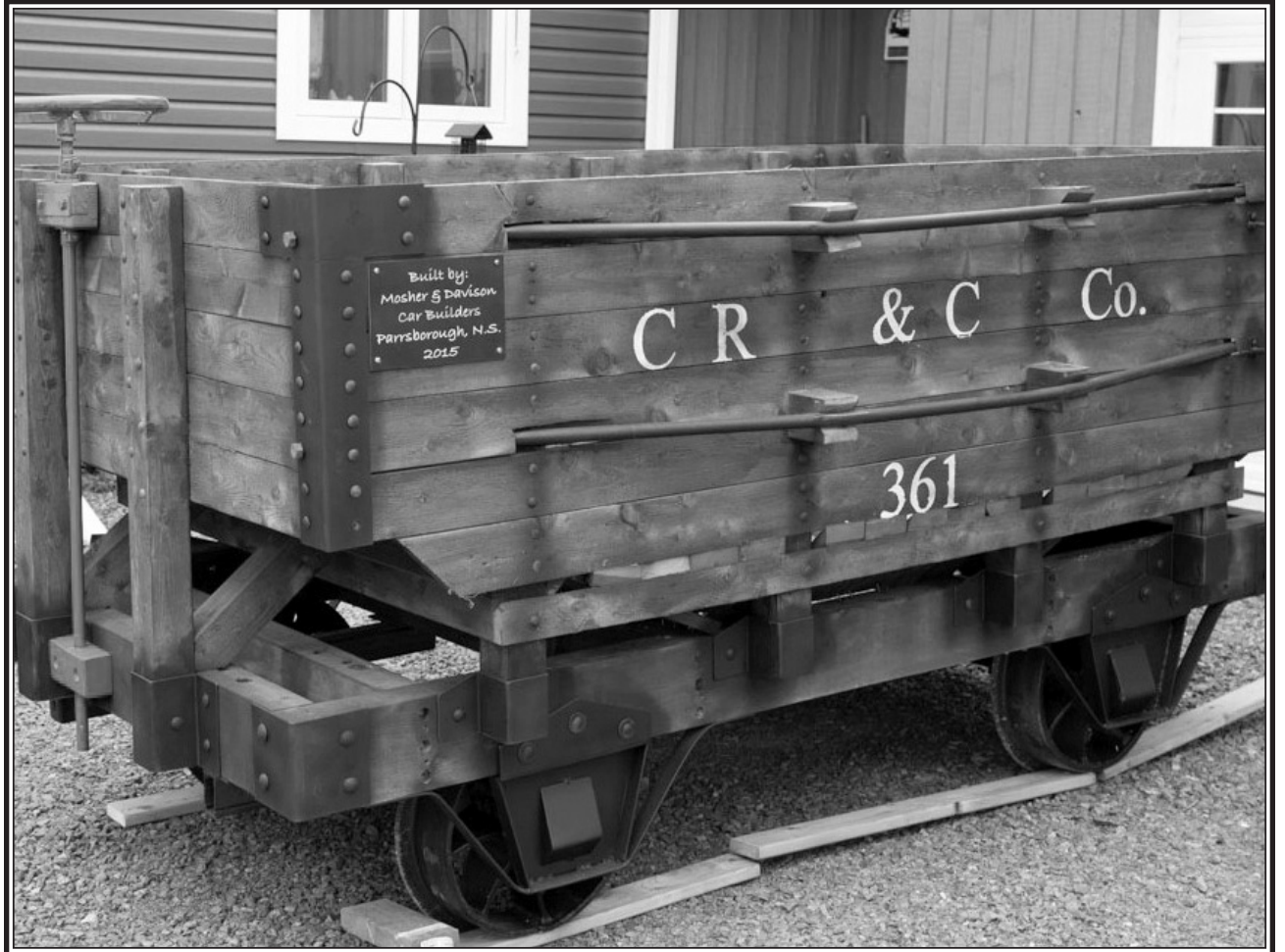
Kerwin built this coal car to scale. Each summer it is on display with Train #4 in downtown Parrsboro adjacent to former town hall building.

Don't hold your breath. It is hard to slow Kerwin down at any age!!!