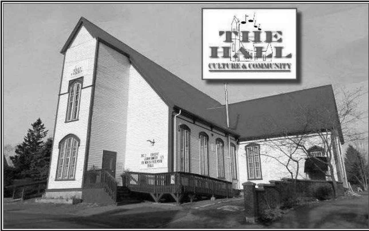
The Parrsboro Band Hall