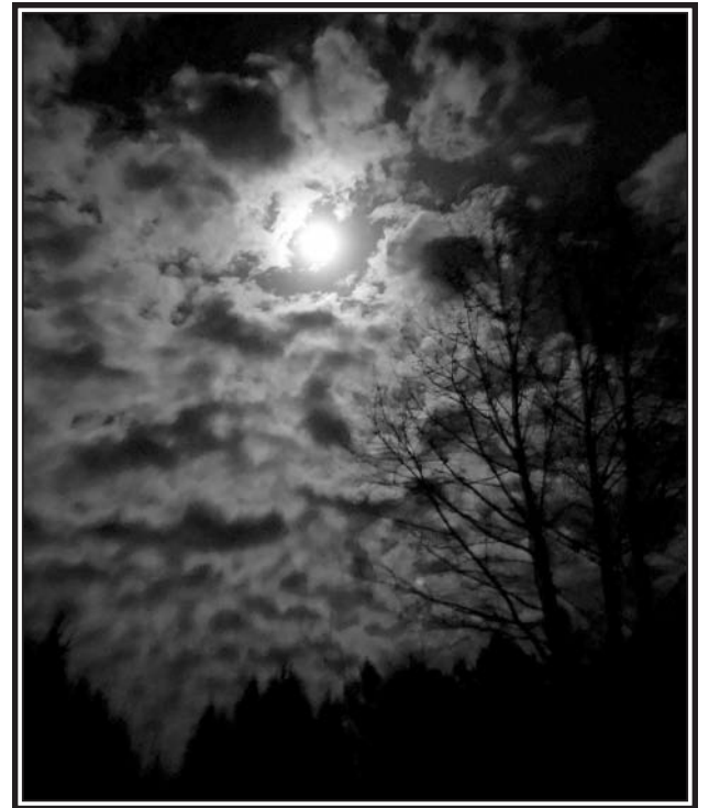
Nighttime photography can be especially complex, then sometimes the moon just lines up with its foreground.

is proud to provide coverage of local events.