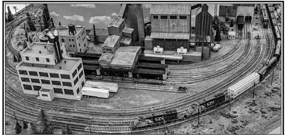
The Amherst Model Train Show was held March 12 at the Sobey's plaza, Amherst. There were plenty of vendors with lots for sale. The main display was so large it could not be captured in one photo, to show the necessary fine detail.