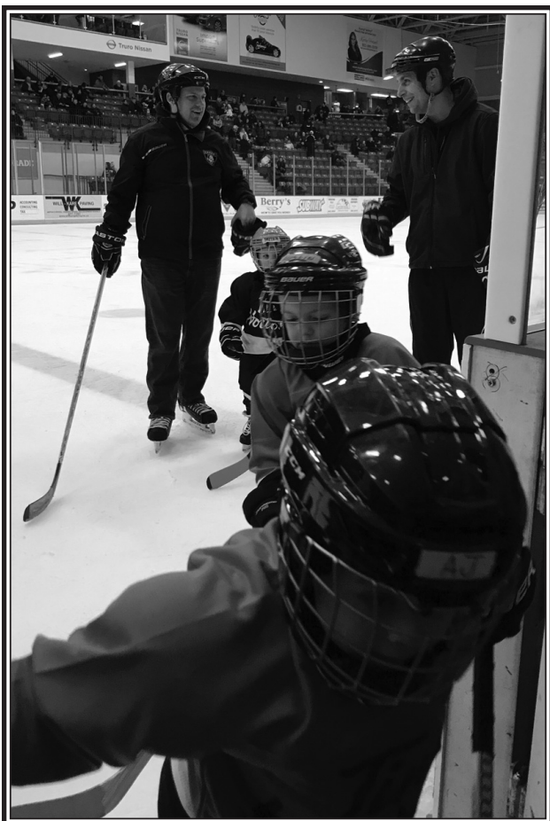
Tim Bits hockey is an important past of the Truro Bearcats intermissions. Many Bearcat players started their relationship with the Cats at a Tim Bit Hockey scrimmage during their Initiation Hockey years.