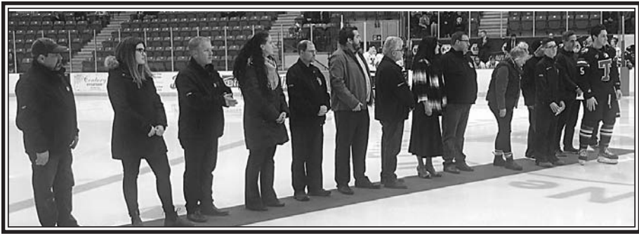
The Truro-Bible Hill Kinsmen Club organizes a donation to selected charities during regular season hockey games. When a Bearcat player scores, a $100 donation goes to a charity. If a Bearcat powerplay is scored, a $200 donation is made. At this year's last regular season home game, the Kinsmen Club presented checks equal to $3,800 to the organizations at center ice. In 18 years, the Power Play Program has donated $83,600 to local charities.