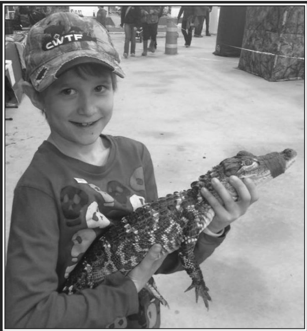
Over 5,000 people attended the Women That Hunt Expo in 2018. This young lad enjoyed his time at the show.