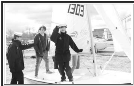
Drop by the Sea Cadets display to see what they can offer you.