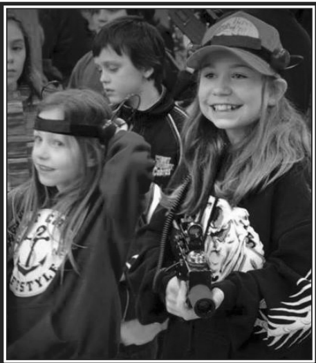
Come to the Youth Expo and try your hand at Laser Tag.