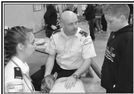
There's lot to do, see and learn including basic instruction from ambulance operators.