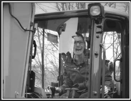
Maybe you want to be an equipment operator. Climb up in the seat and see if it makes you smile.