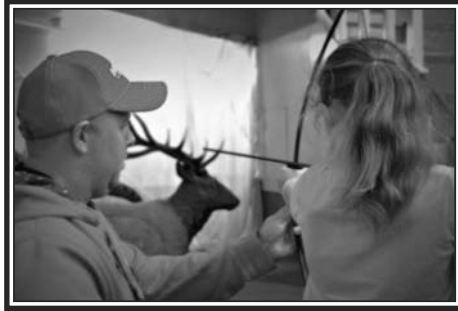
The Archery lane and instruction has always been popular.