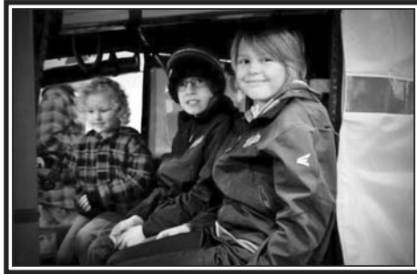
There's lots of equipment to see. Climb up and sit in a rescue vehicle.