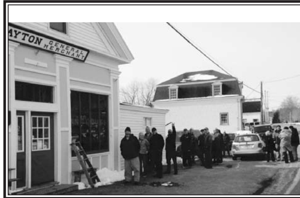
Just about this time last year shoppers lined up waiting for the doors at Great Village Antiques to open after being closed since Christmas.

From April to December hours during the week remain the same at 10:00 am - 5:00 pm, however Sundays vary according to the season. April, May, November and December the destination is open 1:00 pm to 5:00 pm. During the heavier traffic season of May through to end of October, Sunday's store hours are 11:00 am to 5:00 pm. Updates and information about new arrivals can be found on its website or Facebook pages.