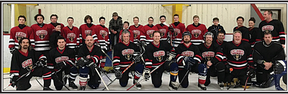
CCJHS's student and teacher hockey teams. Students won 8-4.