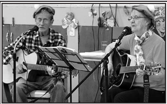
There is always great entertainment at the Debert Legion Friday Night's Supper.